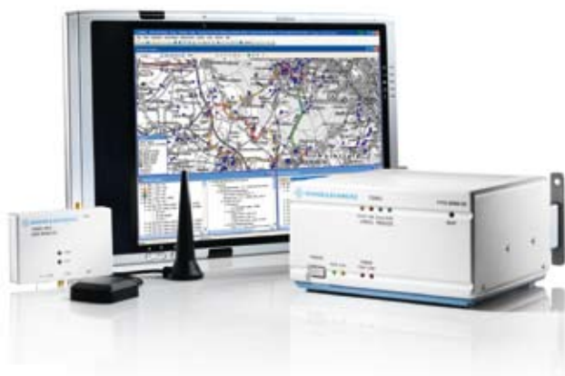
Rohde&Schwarz BTS localization solution components

Mobile telecommunications plays a vital role in today's modern society, which relies on a functioning communications infrastructure to ensure economic growth and stability. Mobile network operators constantly face the challenge of adapting their networks to the customer's behavior. This means network operators must have information about their own and their competitors' BTS locations in order to reduce operations costs through joint location usage.